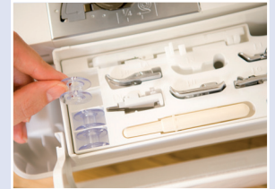
Accessory compartment comfortably holds all the included accessories.