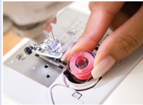
Just drop in a full bobbin and you are ready to sew.