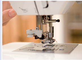
Easy automatic needle threading.